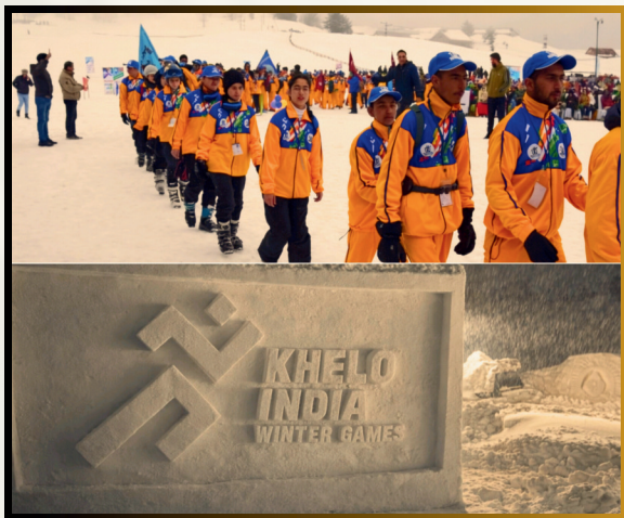
Khelo India Winter Games at Gulmarg

“Sports inspire excellence, discipline and team work”