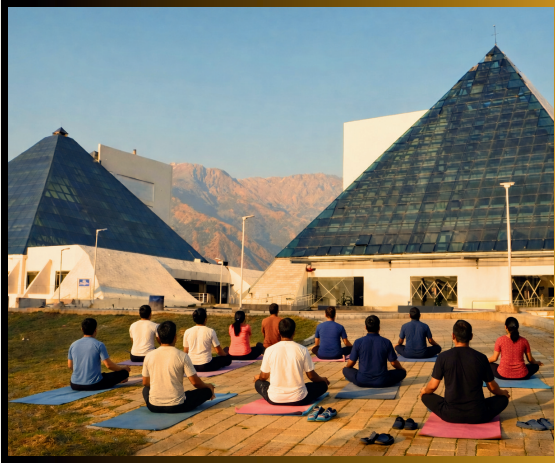
Mantalai International Yoga Centre, Udhampur