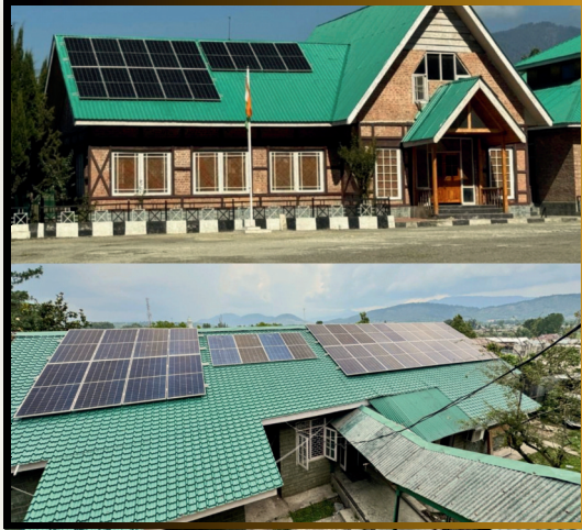
Rooftop Solar panels on Govt. Buildings