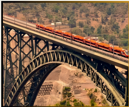
World's highest Railway arch bridge, Reasi.

“Bridging Mountains. Connecting Futures.”