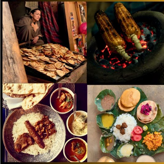
Kashmiri Bread • Bhutta • Traditional Dogra Cuisine Kashmiri Thali