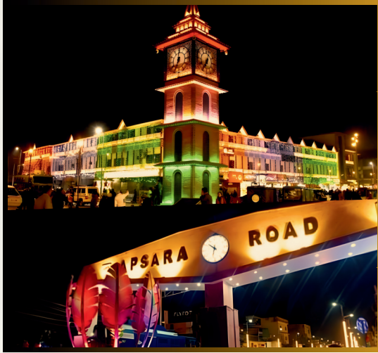
Lal Chowk, Srinagar & Apsara Road, Jammu