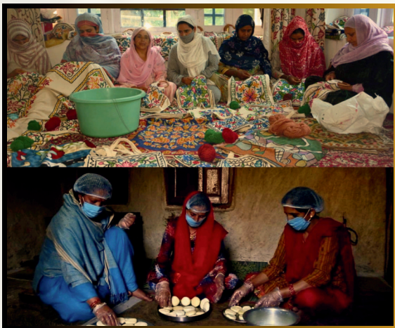
Women-led Self Help Groups (SHGs)

“Women at Work, Prosperity in Progress.”