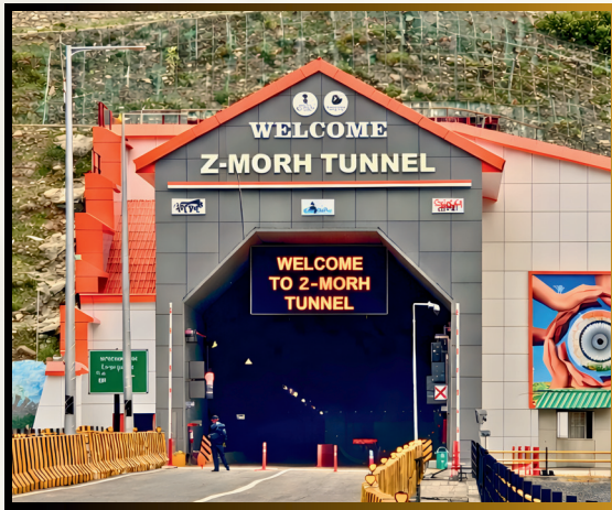
Z-Morh Tunnel, Sonamarg