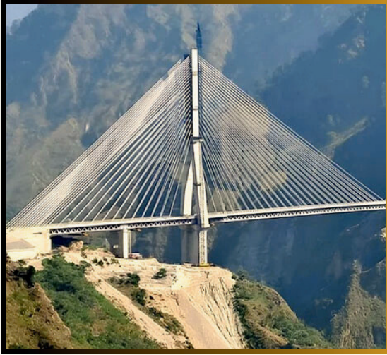
Anji Khad Bridge, Reasi

"Engineering for Progress and Prosperity"